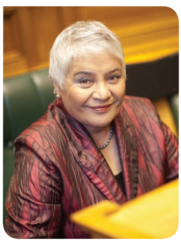
Hon. Dame Tariana Turia, (Ngāti Apa, ↑ Ngā Rauru, Whanganui iwi) Political leader, Smokefree champion

← Whina Cooper, 1895–1994 (Ngāti Kurī) Led the 1975 land march from Te Hāpua to Parliament